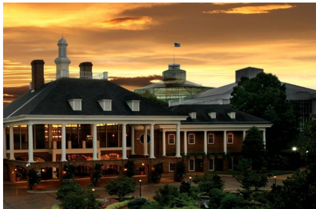
Gaylord Opryland Resort & Convention Center in Nashville, TN

As always, T-Systems will present its PLM and CAD solutions at PLM World, this year in Nashville, Tennessee, June 1-4, 2009.