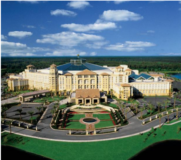
Gaylord Palms Resort and Convention Center in Orlando, FL

As every year, TSystems is presenting its PLM and CAD solutions at the annual PLM World in Orlando, Florida, US, June 2nd to 5th, 2008.