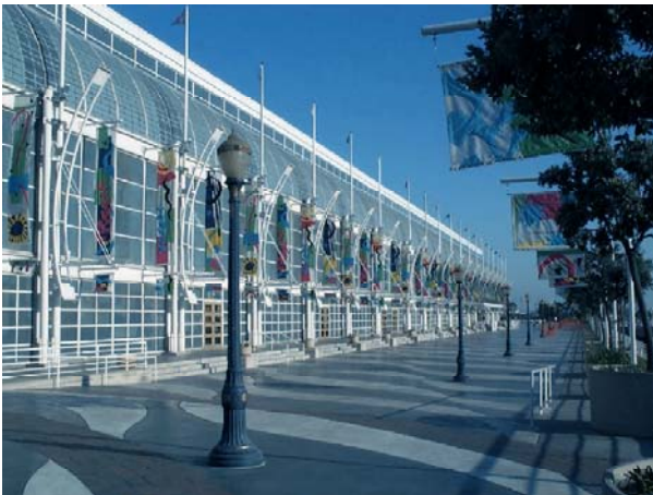
Figure 1 – Long Beach Convention Center

A. Visit us at the PLM World in California