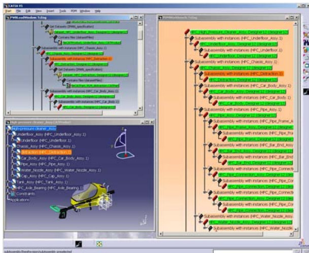
Figure 3 - PDM-Workbench TC Engineering

With the new PDM-Workbench 2.0 release the CAD designer may now register CATIA V5 CATProducts and CATParts in Teamcenter Enterprise from within the PDM-Workbench in CATIA V5. The so called Synchronize functionality allows the automatic creation of the CATIA objects and their relations in PDM.